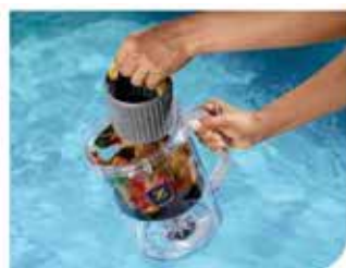
Never touch debris with easy clean strainer basket.