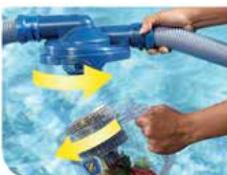
Easy release twist lock top.