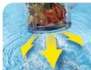
Automatic drain valve for lightweight handling.