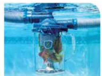
Vertical orientation. Goes virtually unseen in pool.